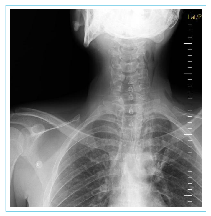
Figure 2. Subcutaneous emphysema is observed in cervical backfront radiography.

Cyanosis, vocal cord paralysis, anaphylaxis, neck, shoulder and widespread subcutaneous emphysema are significant findings in physical examination.<sup>[4]</sup> Cervical lateral radiography, PA lung and lateral chest X-ray have to be preferred in diagnosis at the first stage and subcutaneous emphyse-